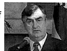
Quebec Premier Lucien Bouchard

Bouchard spent the day visiting the local hospital and seeing for himself where the accident happened. The school was built near the side of a hill. Residents had questioned the safety of the decision.